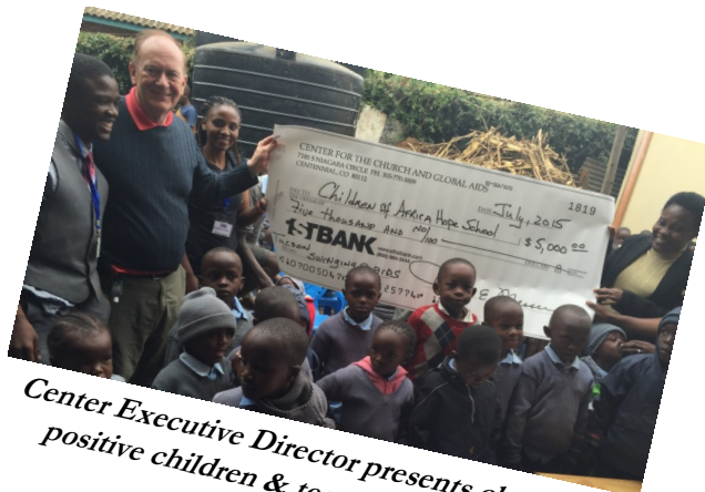
Center Executive Director presents check to HIV positive children & teachers at Kenya school