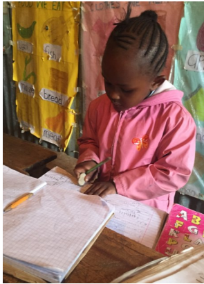
Little girl in Kenya slums is intent on learning