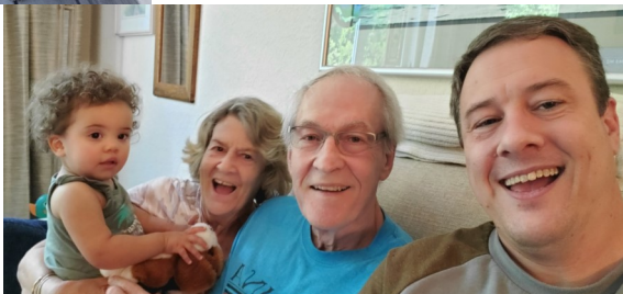
Blinn Couch Golfers