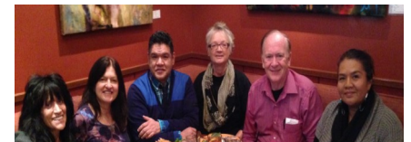
Working with local Native American leaders & National Native American AIDS Prevention Center