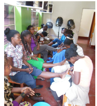
Funding economic empowerment programs (e.g., pedicures & hair styling in Rwanda)