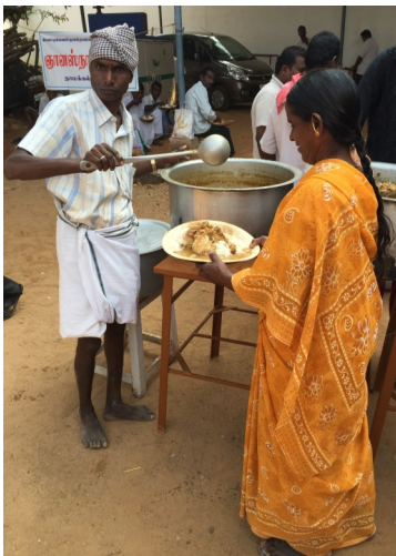
Feeding HIV positive people as food is imperative with medicine. The Center provides a free clinic in India for women and children, helping to stop mother-child HIV transmission