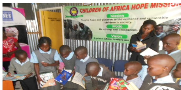
Teaching & feeding HIV positive students in Nairobi, Kenya, school