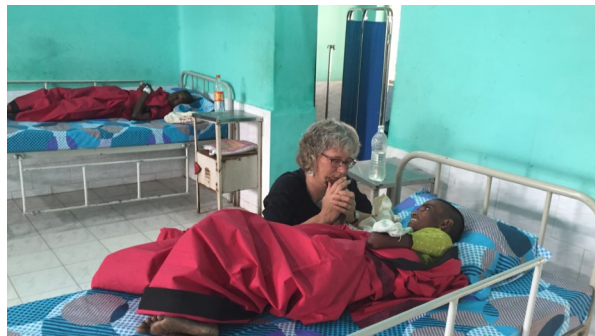
Caring for AIDS patients. including remodeling a public AIDS ward in India