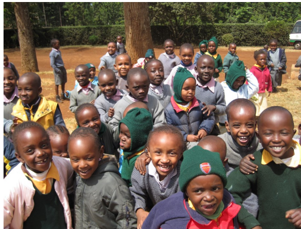
Supporting 230 AIDS orphans in Kenya plus providing programs of care and prevention.