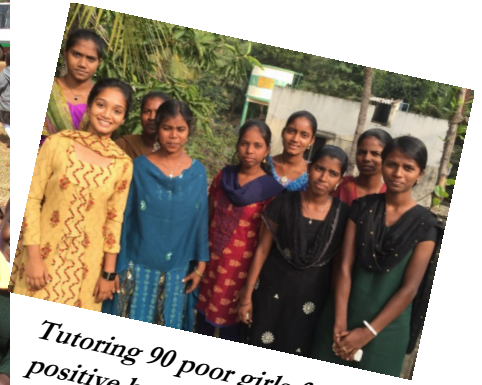
Tutoring 90 poor girls from HIV positive homes; 10 now in college