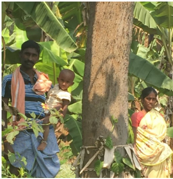
Center supports clinic for pregnant women in remote India tribal area

Thanks! For returning the enclosed envelope.