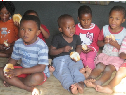
Earnings from a $50,000 endowment supports 16 AIDS orphans