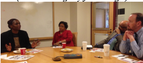
Meeting U of Denver Social Work Dept.